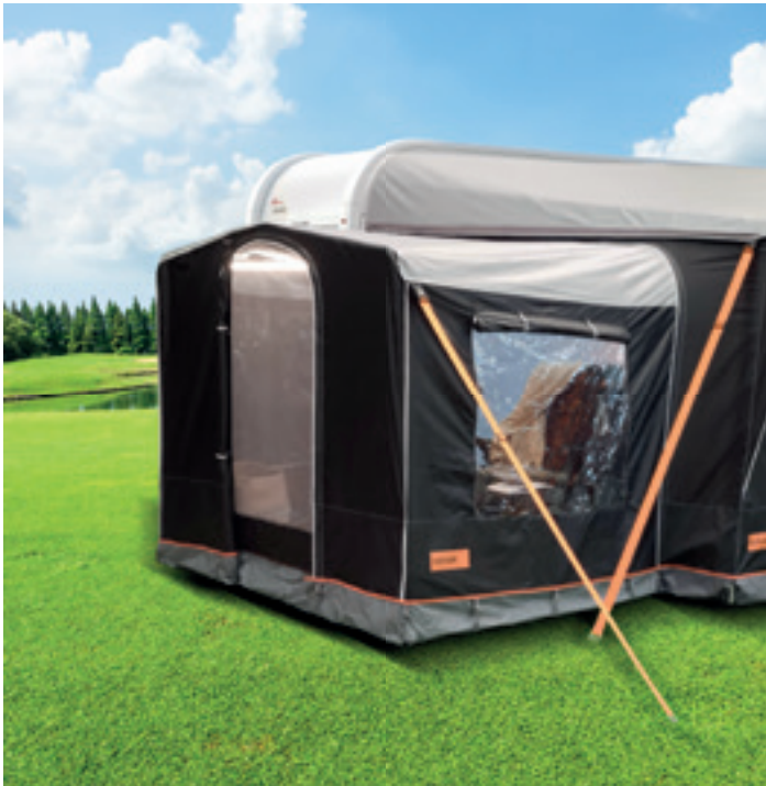
External access door with mosquito net

Expand your living space with the Sunset annex! Soplair has designed an annex for day and night use! This model allows you to enlarge your living space either to store your daily belongings or to create a night space protecting you from the daylight thanks to its shutters. .