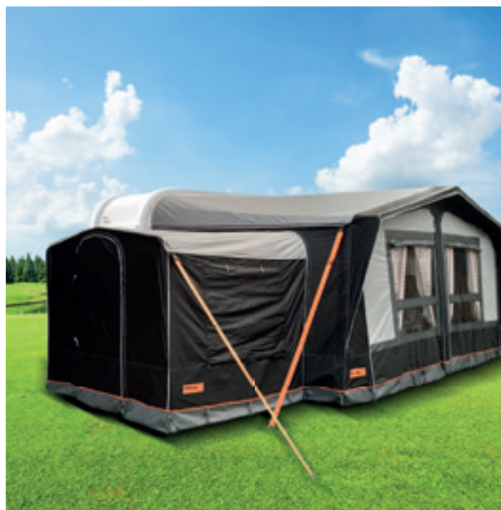
Shutters on all openings